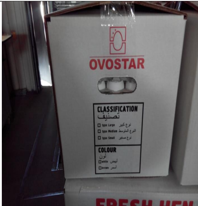
View of tare marking