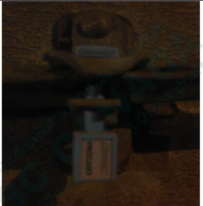
View before the port

The results of inspection are valid for the time and place of inspection only.