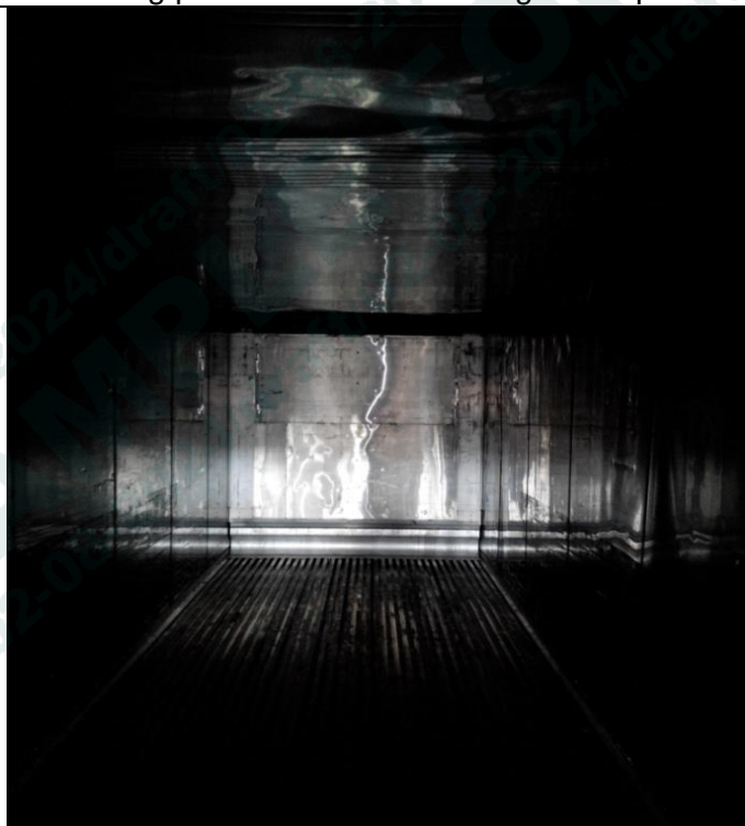
View of container

The following photos were taken during the inspection: