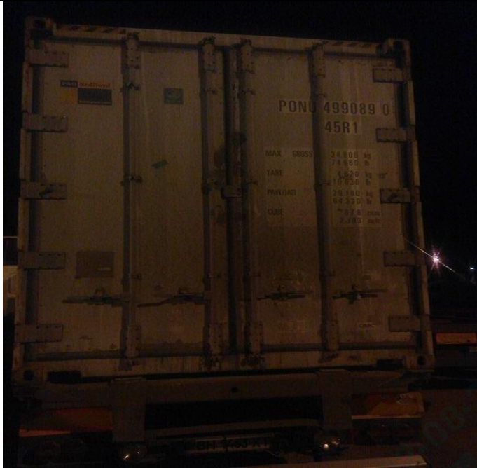
Seal before the port