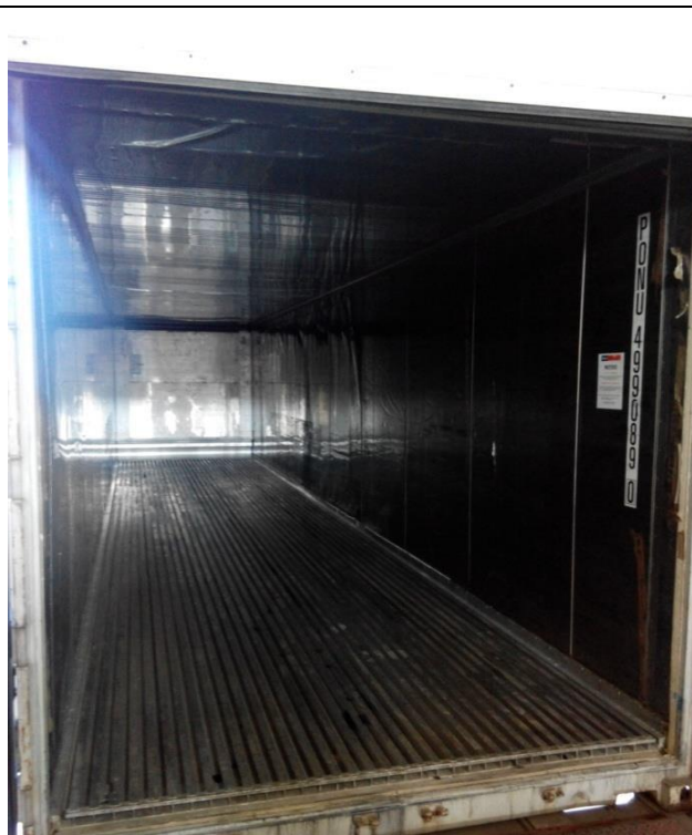
View of container PONU4990890