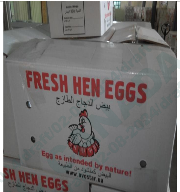
View of marking